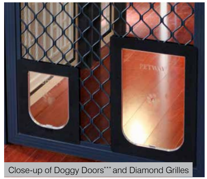
***Available in 3 sizes: small, medium and large.